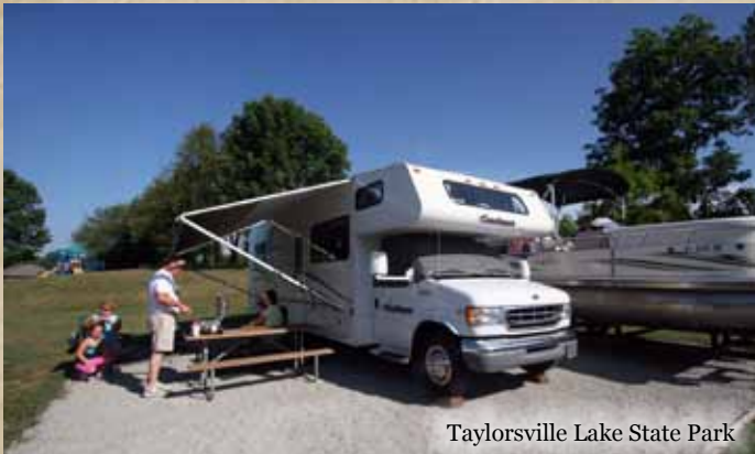
Taylorsville Lake State Park