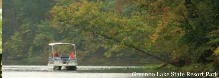
Greenbo Lake State Resort Park

All our ingredients are of the highest quality and as a supporter of the Kentucky Proud program, we use locally grown meats and produce when available.